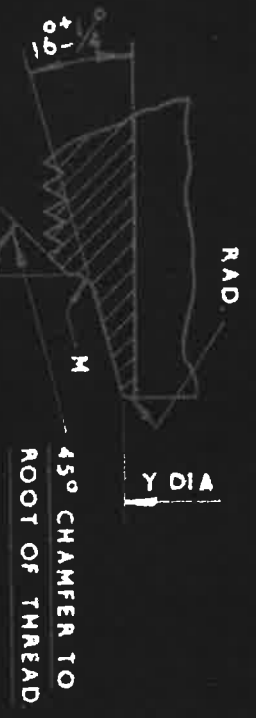
ENLARGED VIEW OF CONE END

SMOOTH FINISH FREE FROM VISIBLE TOOL MARKS